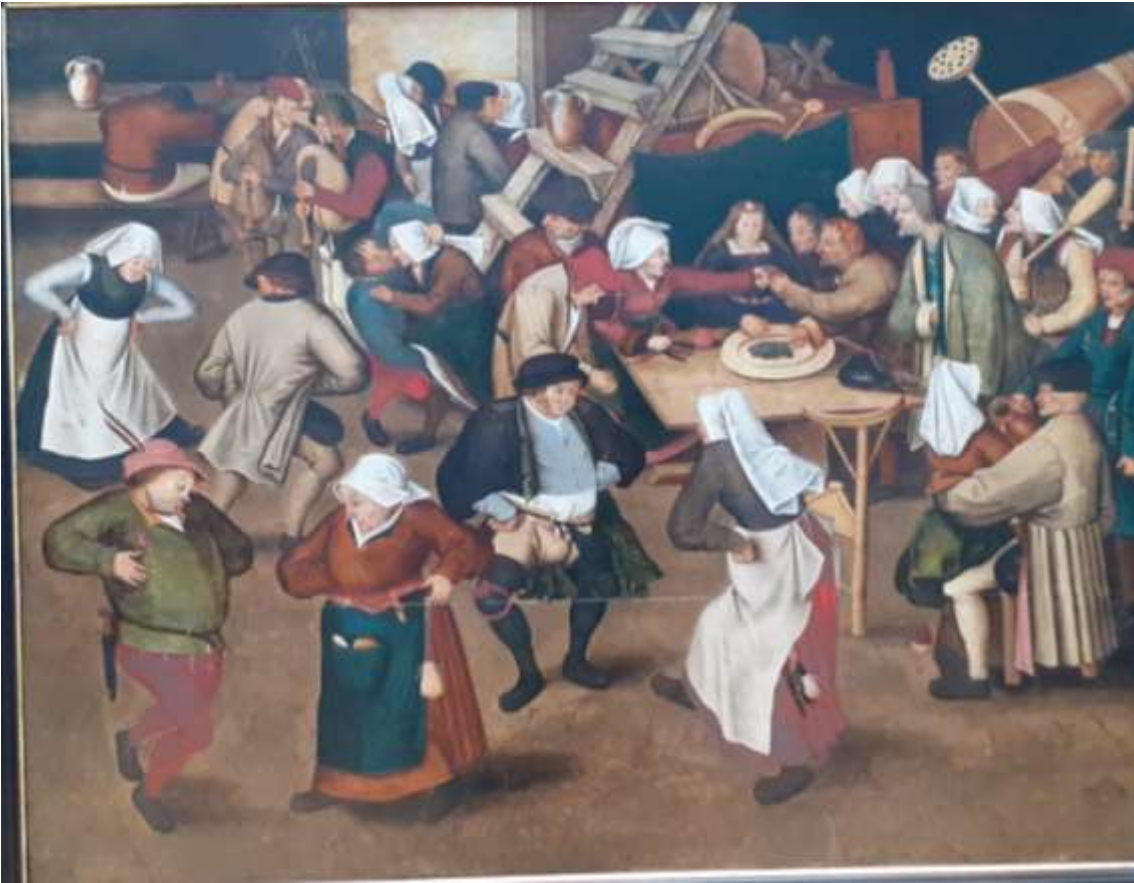
Id. Pieter Bruegel